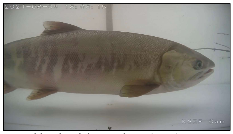
View of chum through the camera box at KSEF on August 9, 2021

To date we have counted 179 chum salmon through the KSEF. This year's chum escapement compares to a maximum observed to the day of 1,758 in 2005, which resulted in an overall escapement of 1,862 and a minimum observed to the day of 61 in 2008, which resulted in an overall escapement of 150. Based on average run timing for chum salmon to the day (2003-2019) it is predicted that approximately 82.0% of the run should now have passed the KSEF. For more information on cumulative Kitwanga chum salmon abundance by date, refer to the chum salmon graph below.