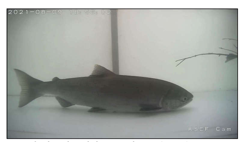
View of sockeye through the camera box at KSEF on August 9, 2021

To date we have counted 152 sockeye through the KSEF. This year's sockeye escapement compares to a previous maximum observed to the day of 17,703 in 2010, which resulted in an overall escapement of 20,804 and the minimum observed to the day of 79 in 2019, which resulted in an overall escapement of 125. Based on average run timing for Kitwanga sockeye to the day (2003-2019) it is predicted that approximately 78.8% of the run should have passed the KSEF. For more information on cumulative Kitwanga sockeye salmon abundance by day, refer to the sockeye salmon graph below.