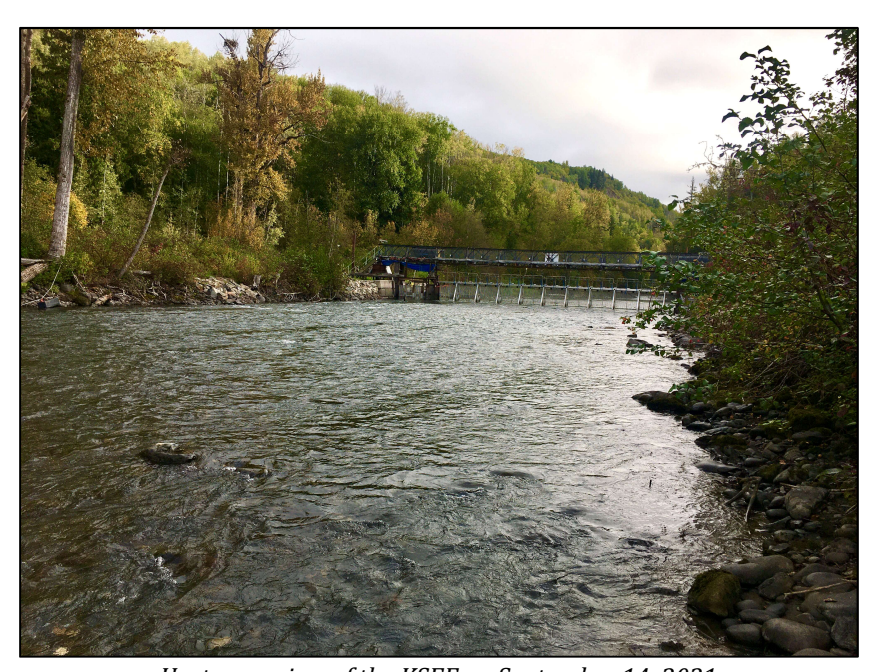
Upstream view of the KSEF on September 14, 2021

The Gitanyow Fisheries Authority (GFA) is pleased to announce that the Kitwanga River Adult Salmon Enumeration Facility (KSEF) is operational for 2021. Like in other years GFA will be providing weekly updates on salmon escapement to the Kitwanga River (middle Skeena index) from July through to the end of October. This year marks the 19<sup>th</sup> consecutive year that GFA has implemented the program, which collects important inseason pacific salmon stock assessment and biological information. GFA would like to thank their 2021 funders and supporters, specifically the Gitanyow Chiefs (Gitanyow Huwilp Sustainability Fund), the Pacific Salmon Commission's Northern Endowment Fund and Fisheries and Oceans, Canada. GFA would also like to acknowledge and thank the Gitwangak Wilp Simadeeks for allowing GFA to continue to work within their traditional territory, as set out by our 2002 agreement. As in other years, weekly updates will be distributed and posted on our website: <a href="https://www.gitanyowfisheries.com">www.gitanyowfisheries.com</a>