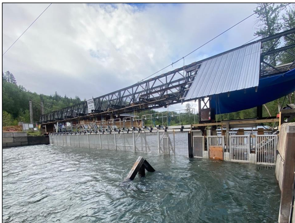
Downstream view of KSEF on August 3, 2022

The Gitanyow Fisheries Authority (GFA) is pleased to announce that the Kitwanga River Adult Salmon Enumeration Facility (KSEF) is operational for 2022. Like in other years GFA will be providing weekly updates on salmon escapement to the Kitwanga River (middle Skeena index) from July through to September. This year marks the 20 th consecutive year that GFA has implemented the program, which collects important in-season pacific salmon stock assessment and biological information. GFA would like to thank their 2022 funders and supporters, specifically the Gitanyow Chiefs (Gitanyow Huwilp Sustainability Fund), the Pacific Salmon Commission's Northern Endowment Fund and Fisheries and Oceans, Canada. GFA would also like to acknowledge and thank the Gitwangak Wilp Simadeeks for allowing GFA to continue to work within their traditional territory, as set out by our 2002 agreement. Weekly updates will be distributed and posted on our website: www.gitanyowfisheries.com