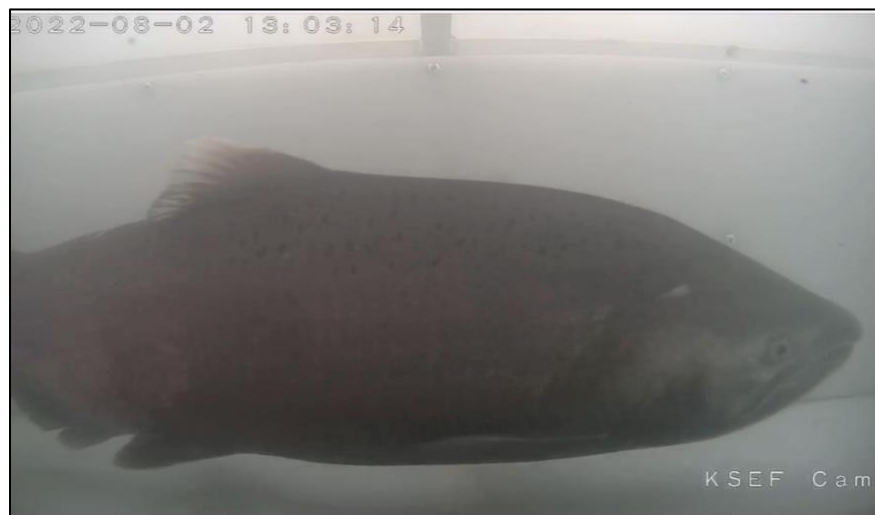
View of Chinook through the camera box at KSEF on August 2, 2022

To date we have counted 72 Chinook (plus 1 jack) through the KSEF. This year's Chinook escapement compares to a maximum observed to the day of 1,194 in 2007, which resulted in an overall escapement of 3,225 and the minimum observed to the day of 2 in 2012, which resulted in an overall escapement of 848 for the year. Based on average run timing for Kitwanga Chinook to the day (2003- 2019 & 2021) it is predicted that approximately 25.7% of the run should have passed the KSEF. Of note, because the KSEF operations started 13 days later than normal (usual start date of July 10), it is likely that some Chinook may have passed the site before it became fish tight, however based on average run timing between July 10-23 (2003-2019 & 2021) only about 5.3% of the run would have been missed. The final Kitwanga Chinook escapement for 2022 will be adjusted in the post-season to account for the late start. For more information on cumulative Kitwanga Chinook salmon abundance by date, refer to the Chinook graph below.